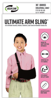
Child/Small Adult #J50101

Fits 25 - 50 lbs / 2'5" - 3'7" tall 12-23kgs / 80-115 cm tall