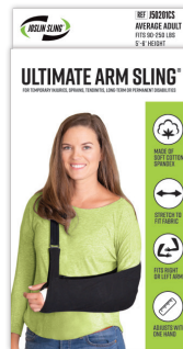
Average Adult #J50201

Fits 50-90 lbs / 3'5" - 5' tall 23-41kgs / 106-152 cm tall