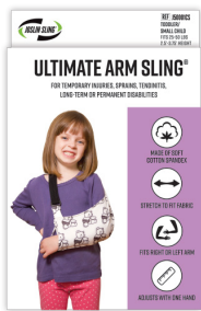
Toddler/Small Child #J50001

Fits 25 - 50 lbs / 2'5" - 3'7" tall 12-23kgs / 80-115 cm tall