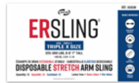
Triple XXX #J63538

Fits 90 - 250 lbs / 5' - 6' tall 41-114 kgs / 152-183 cm tall