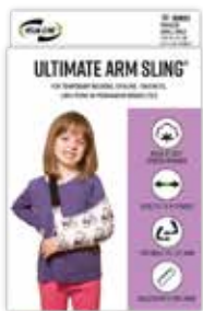
Toddler/Small Child #J50001

Fits 25 - 50 lbs / 2'5" - 3'7" tall 12-23kgs / 80-115cm tall