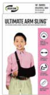
Child/Small Adult #J50101

Fits 50-90 lbs / 3'5" - 5' tall 23-41kgs / 106-152cm tall