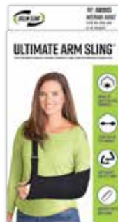
Average Adult #J50201

Fits 90-250 lbs / 5' - 6' tall 41-113 kgs / 152-183cm tall