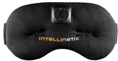
Patent number 7,601,168. Other patents pending.

UNISEX 07230 SMALL • 07231 MEDIUM • 07232 LARGE MSRP $119.99