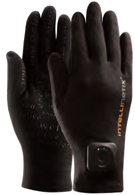
Patent numbers 10,695,261 and 9,775,769

COMFORTABLE, NON-INVASIVE AND 100% DRUG-FREE RELIEF FOR ARTHRITIC HANDS, JOINT PAIN, HEADACHES AND MORE.